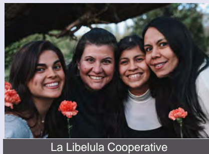
La Libélula Cooperative