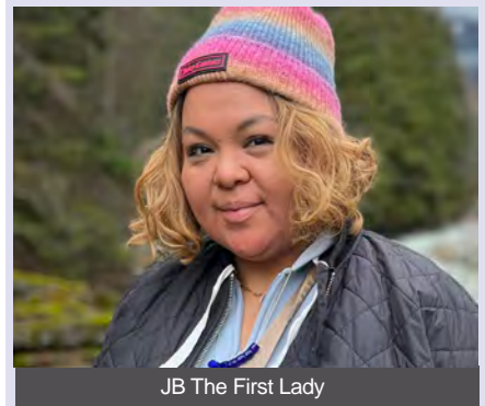
JB The First Lady

Sun 12:00-4:00pm Feb 2, 9, 16, 23 Conference Room