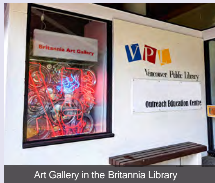
Art Gallery in the Britannia Library